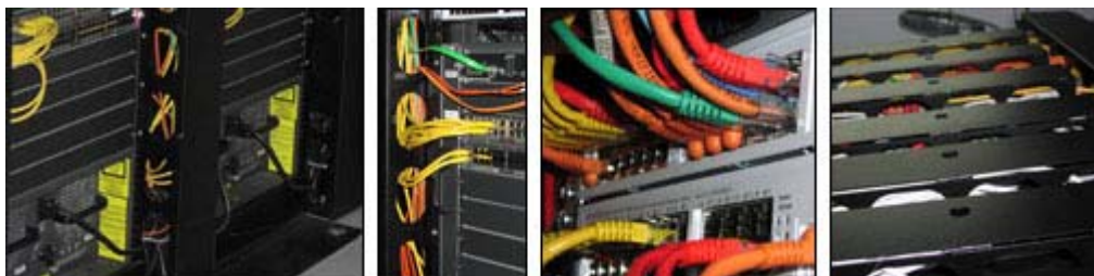
Figure 5 – Network Room

Cisco equipments are used for network distribution to all servers and racks.