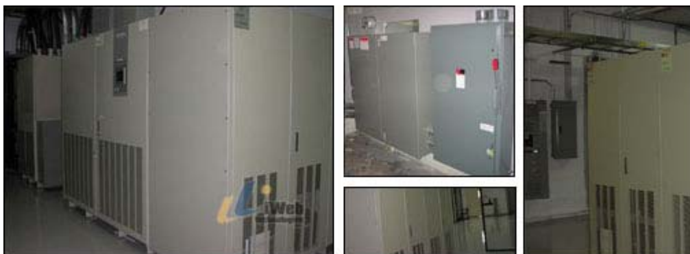
Figure 3 – 300KVA UPS

IWeb site includes a 300KVA UPS and a 500KVA diesel generator.